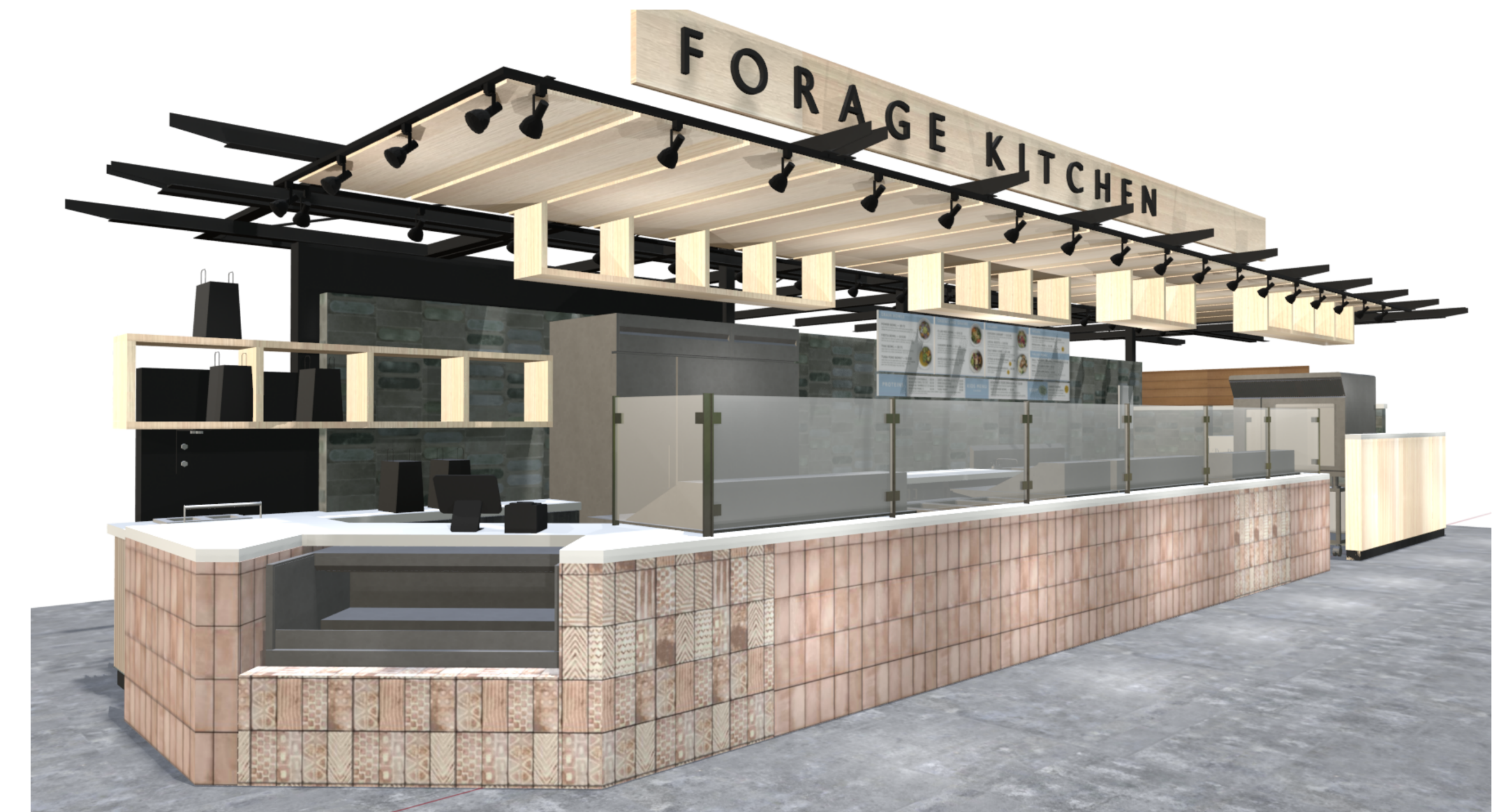
2C/A101 RENDERING 1 1/8"=1'-0"