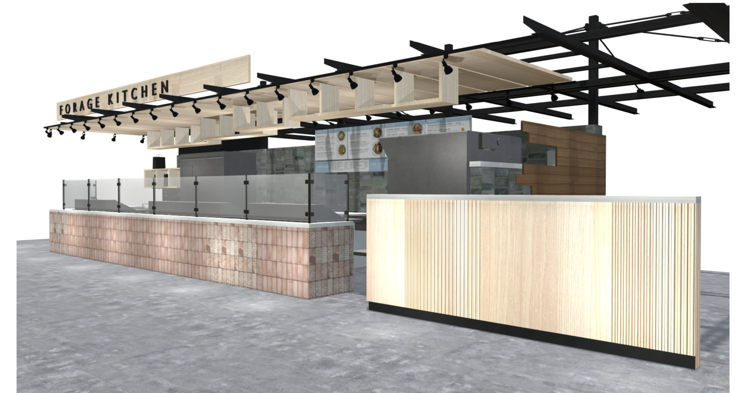
2B/A101 RENDERING 2 1/8"=1'-0"