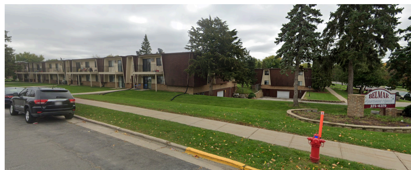
4A/A000 EXISTING - CORNER OF THURSTON LANE AND RED ARROW T

PROPOSED REMOVAL OF FAUX MANSARD ROOFS (TYP.)