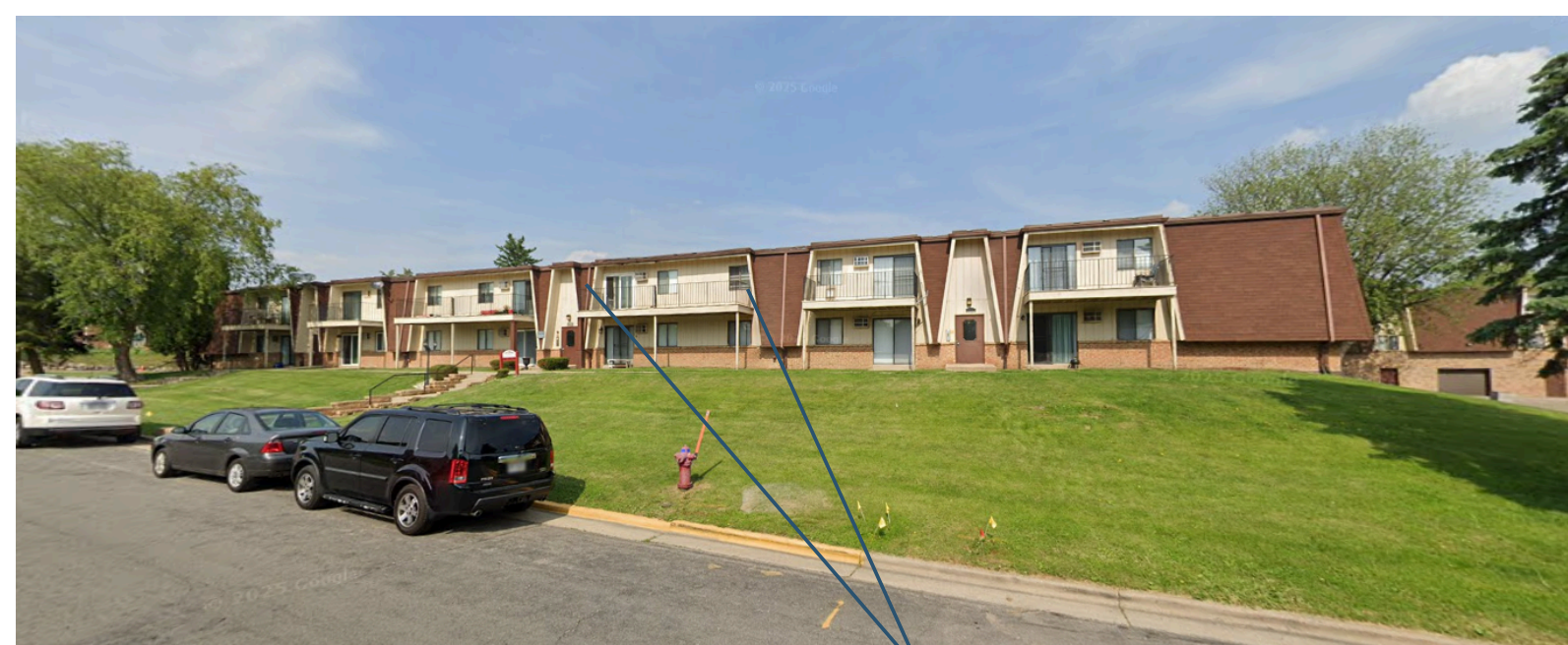
5A/A000 EXISTING - ALONG RED ARROW TRAIL 1

PROPOSED REMOVAL OF FAUX MANSARD ROOFS (TYP.)