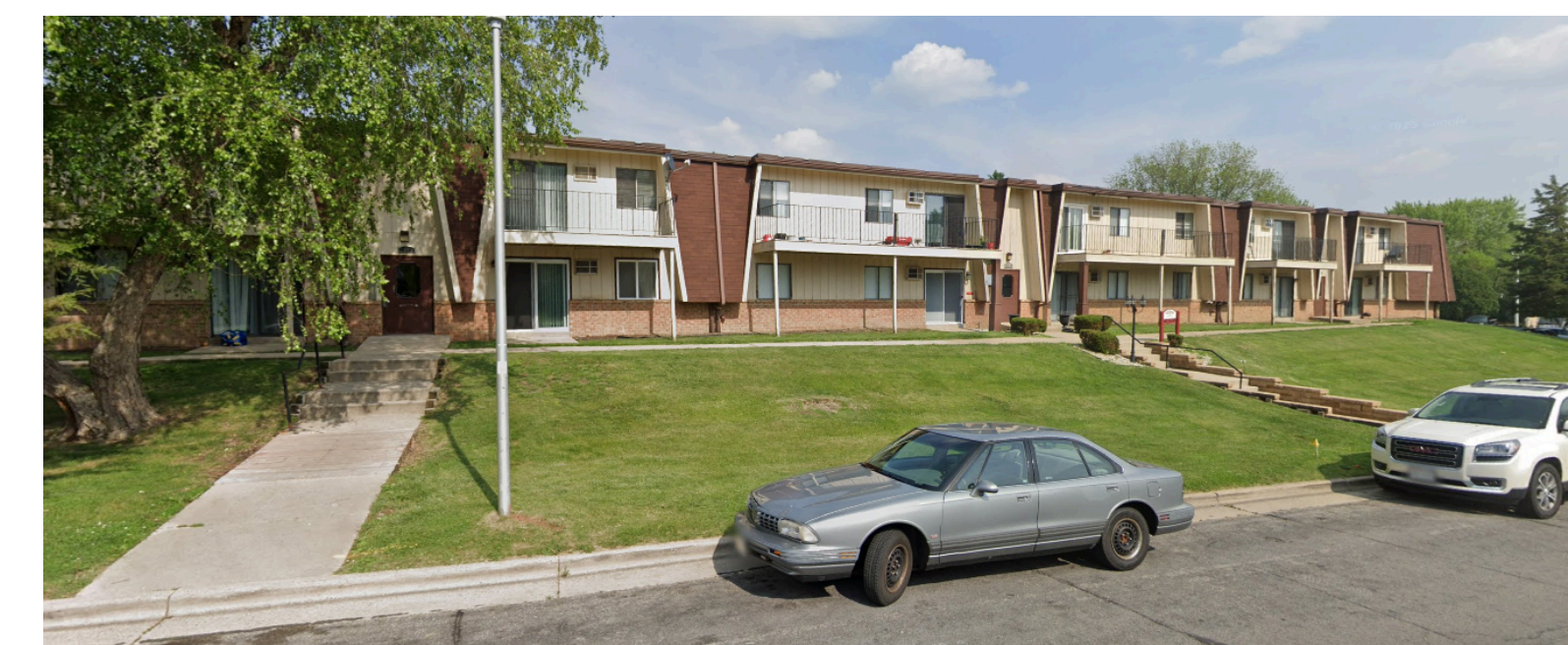
2A/A000 EXISTING - ALONG RED ARROW TRAIL 2