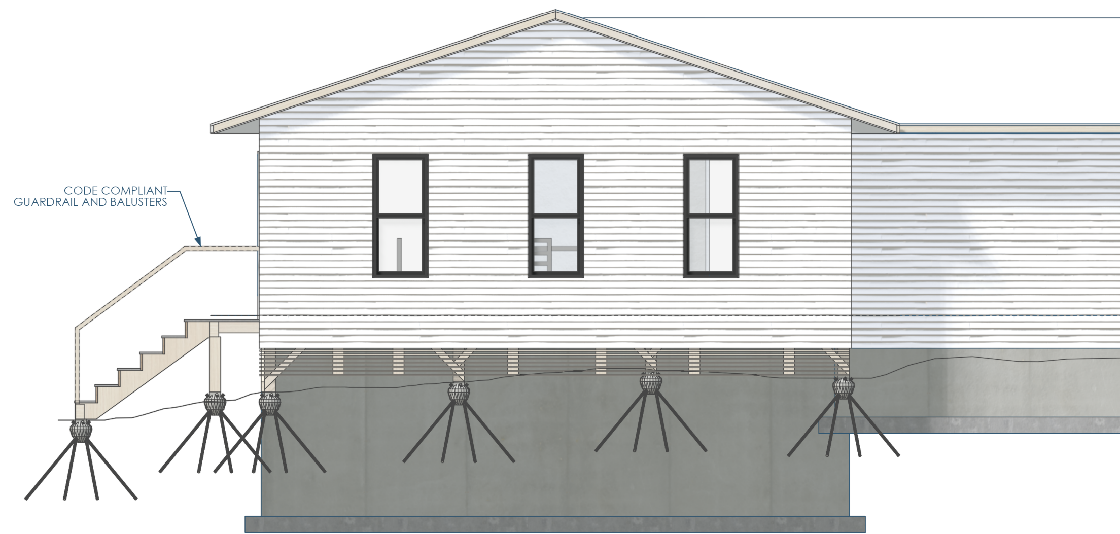
5A/A100 NORTH ELEVATION 1/4"=1'-0"