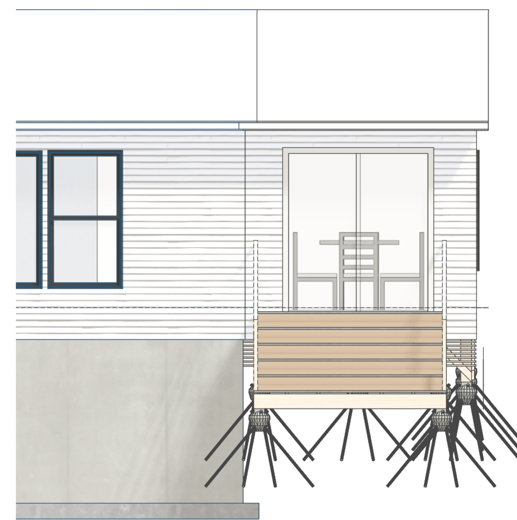
4A/A100 EAST ELEVATION 1/4"=1'-0"