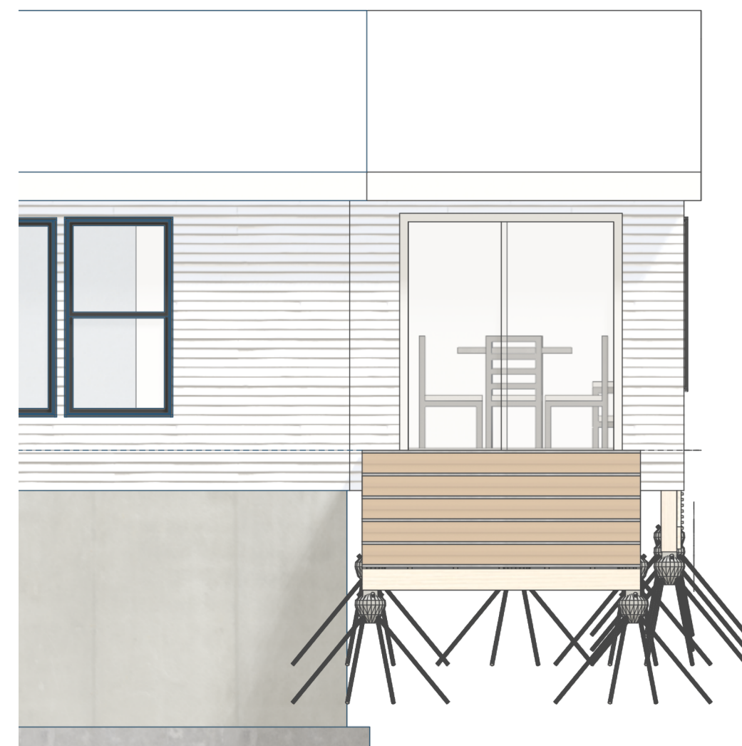
4/A300 EAST ELEVATION 1/4"=1'-0"