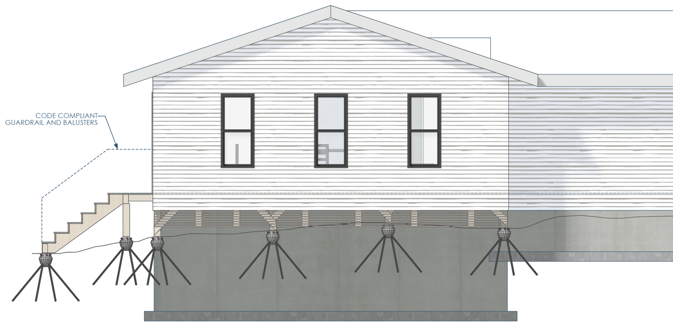
2/A300 NORTH ELEVATION 1/4"=1'-0"