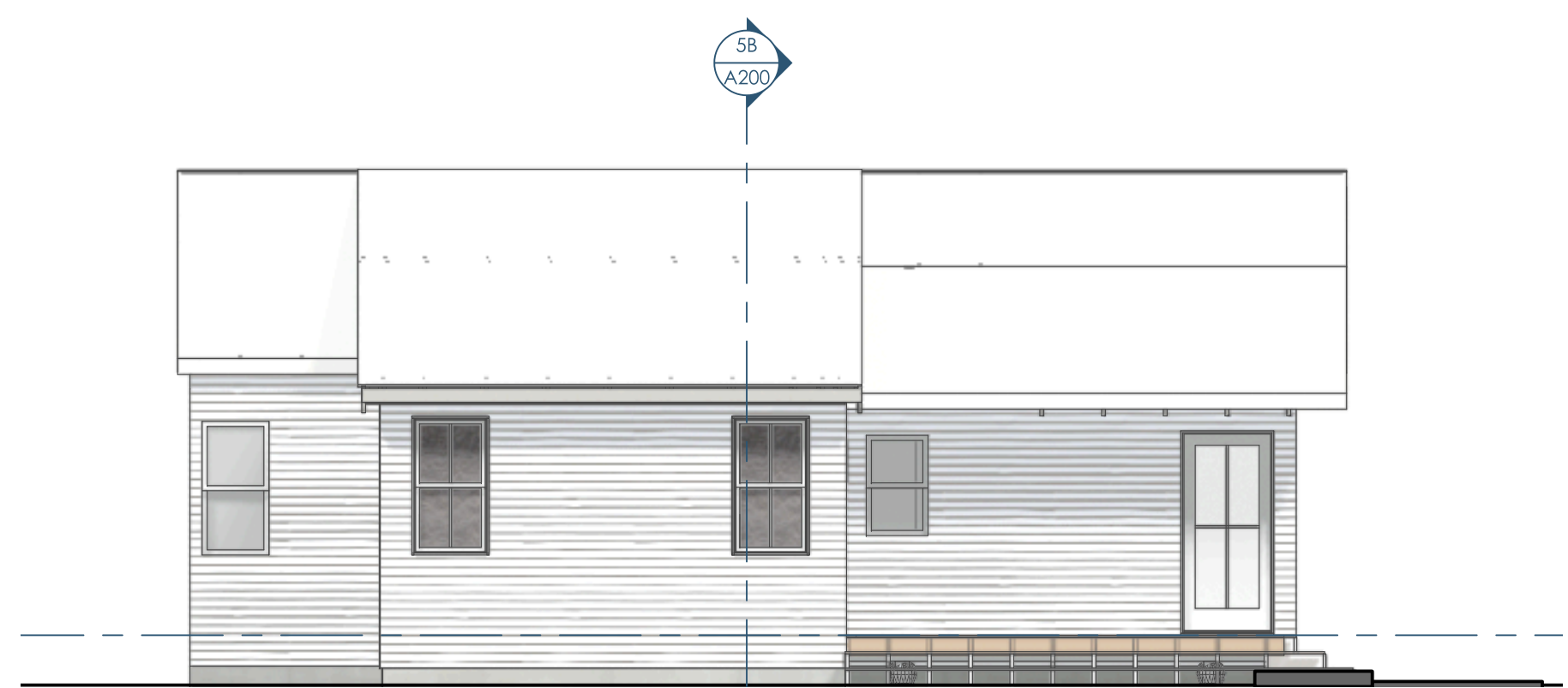
2C/A200 ELEVATION - NORTH 3/16"=1'-0"