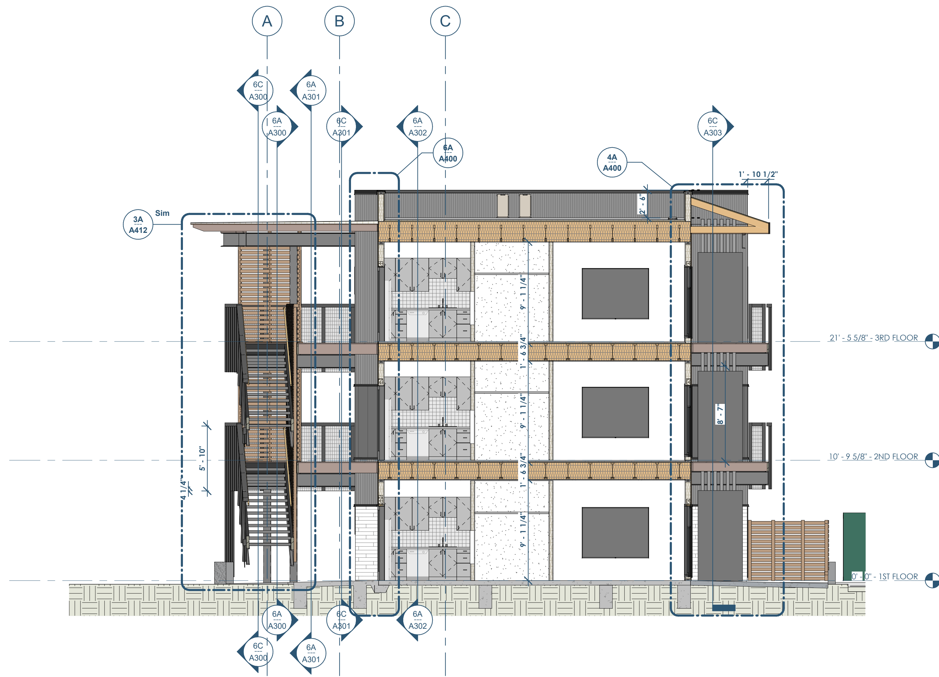
3C A302 BUILDING SECTION - THRU SMALL STUDIO - LOOKING EAST 3/16" = 1'-0"