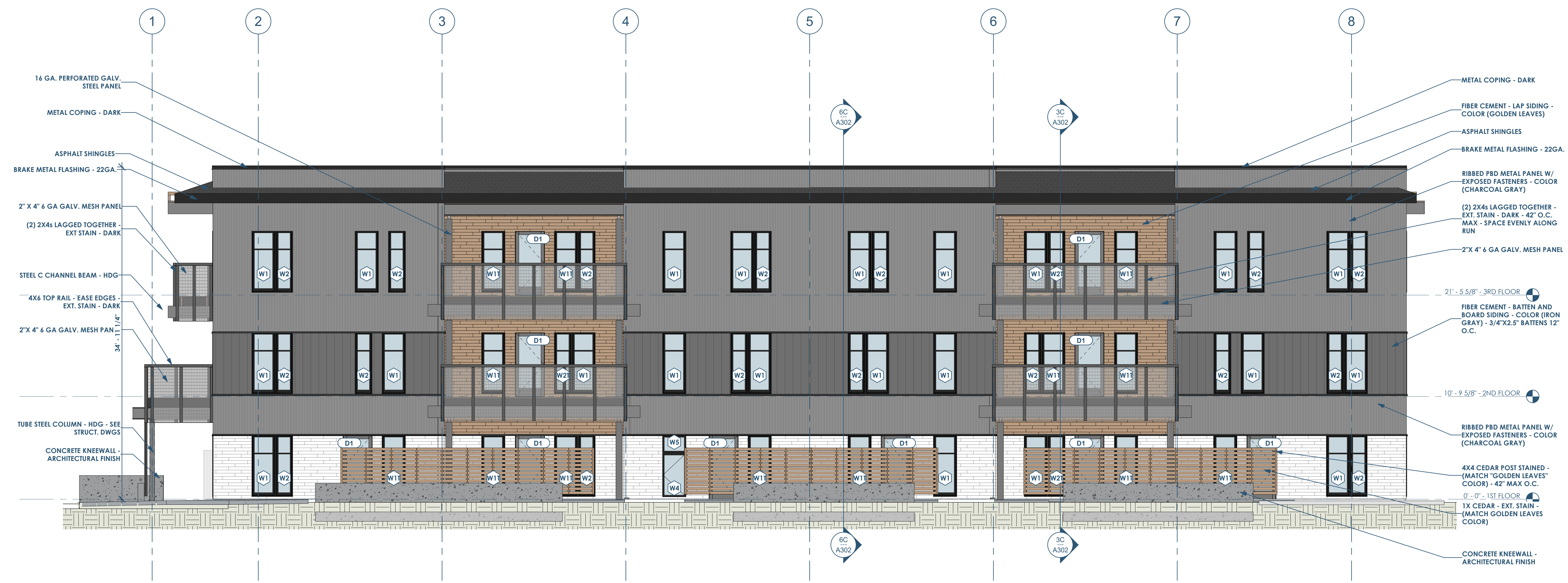
6C A201 BUILDING ELEVATION - SOUTH 3/16" = 1'-0"