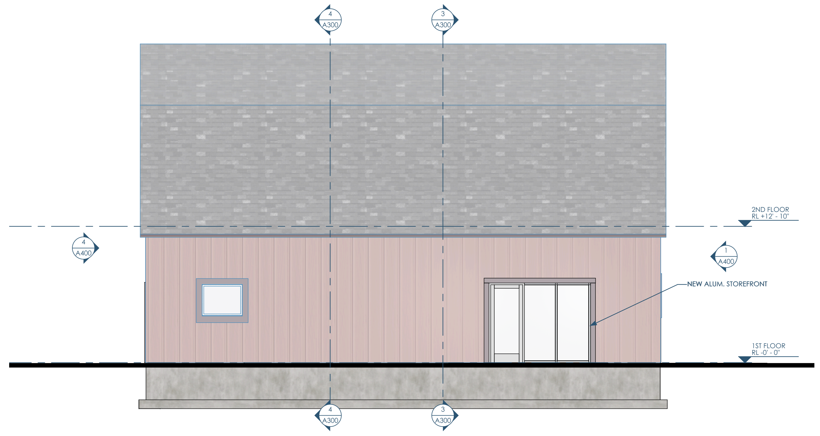
3/A400 ELEVATION - SOUTH 3/16"=1'-0"