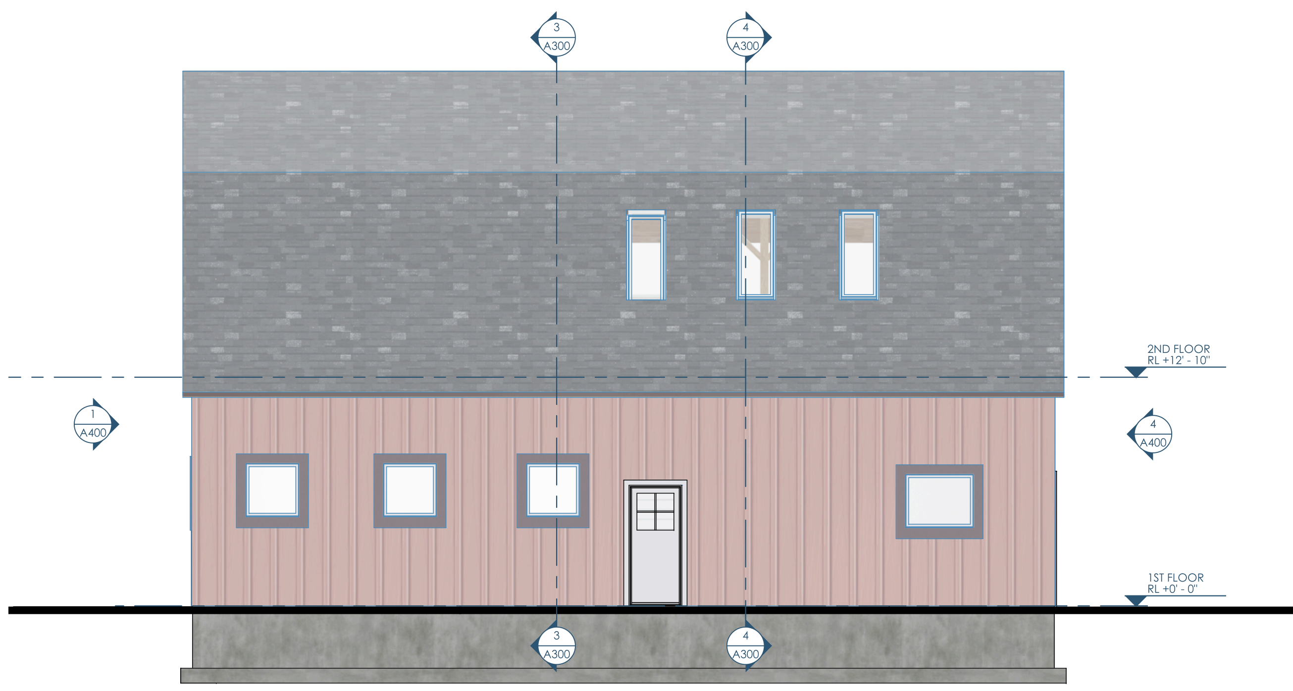
2/A400 ELEVATION - NORTH 3/16"=1'-0"