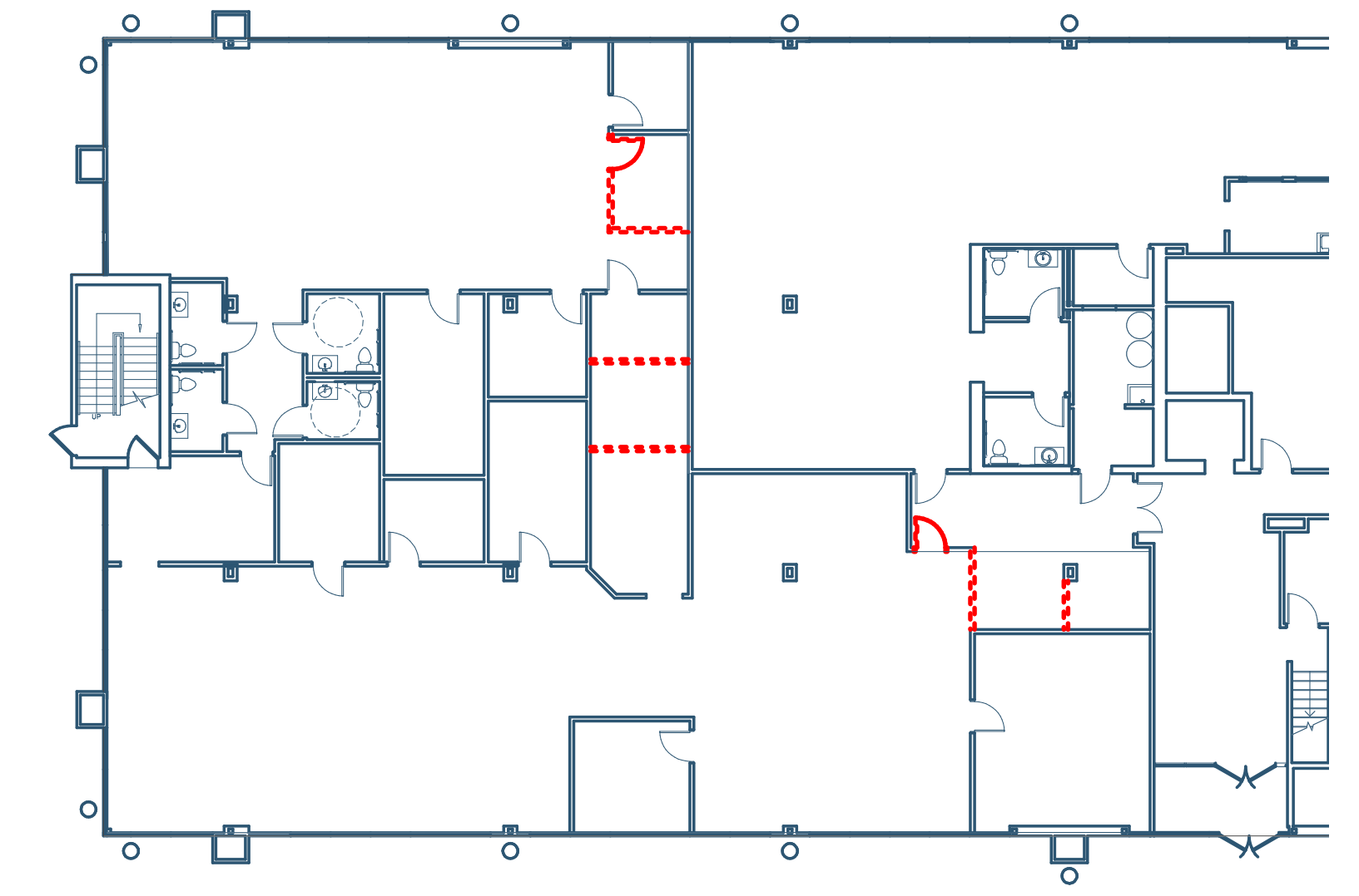
2/A100 DEMO PLAN 1/16"=1'-0"